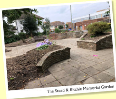
The Stead & Ritchie Memorial Garden